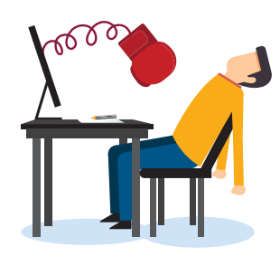
Quitting something because it is tough