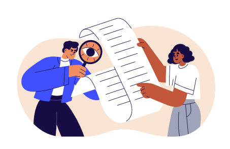
Double-checking your work for mistakes