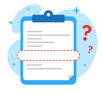
Not completing your work