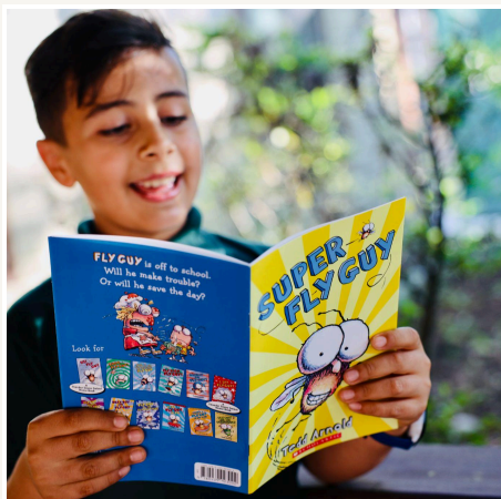
Image preview (only for visual purposes; use link above to download hi-res asset).