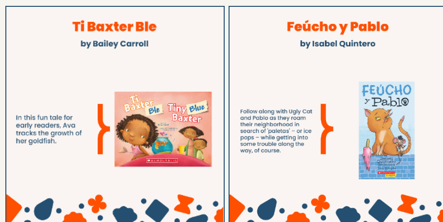
Image preview (only for visual purposes; use link above to download hi-res asset).