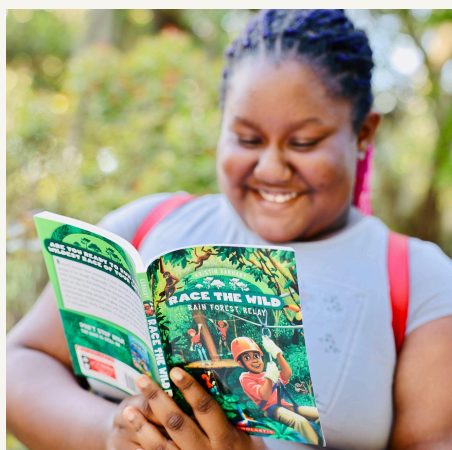
Image preview (only for visual purposes; use link above to download hi-res asset).